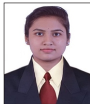
BHAKTI BABAR EMTEC 4.00 LPA.